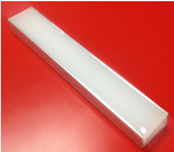
Shown potted with opal optical resin