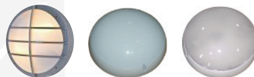
Other options available